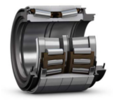
Tapered roller bearing units with outer ring coating